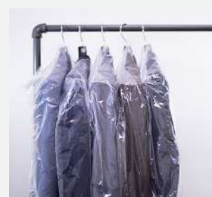
Garment and laundry bags