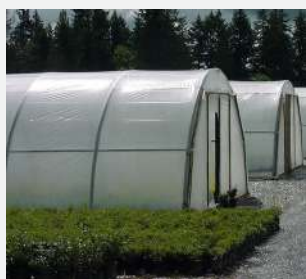
Plastic green house films, green house plastic plates

Some of the Plastic Agricultural Products in include: