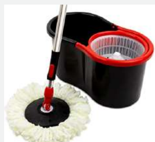
Brooms, Mops and Cleaning systems