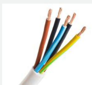
Wire & cable production compounds