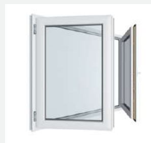
Window and outdoor use compounds