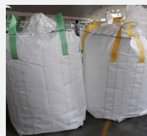
Bulk materials, grain and cement packaging sacks