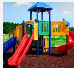
Toys and playground items