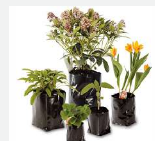
Seedling bags and pots