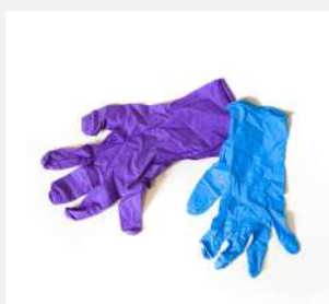
Disposable single use gloves and foot protection.