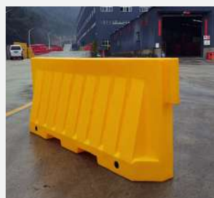
Construction supplies: warning tapes,road barriers