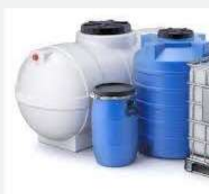
Bulk chemicals packaging