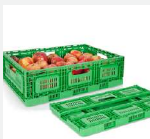
Produce packing plastic boxes