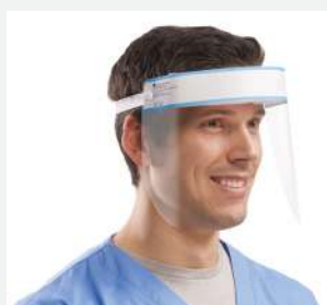
Protective face shields