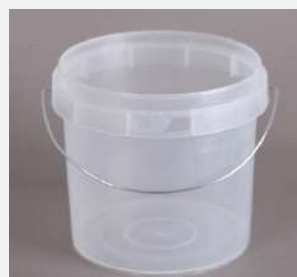
Paint and chemical packaging