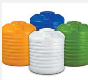
Building utilities: water tanks, fire systems