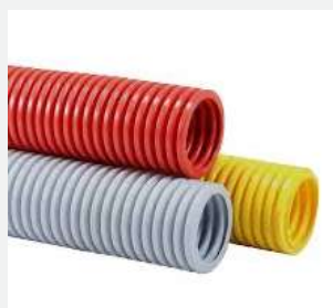
Electrical: conduits, fittings,insulation,outlets