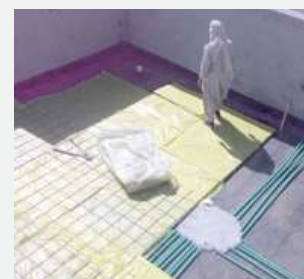
Building insulation materials