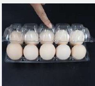
Poultry cages and egg packaging boxes and trays