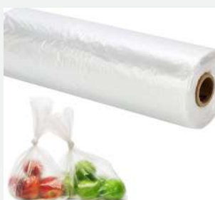
Grocery bags and rolls