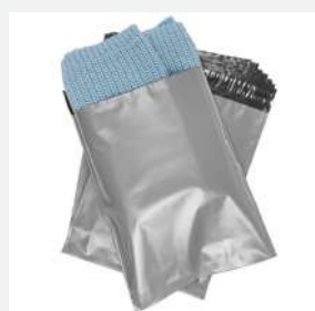
Shipping bags and parcels