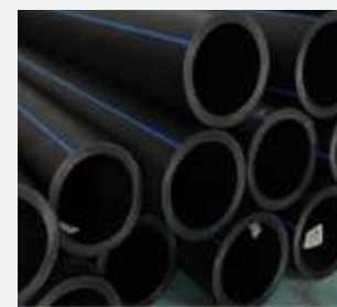
Main irrigation and water transportation high pressure piping