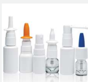
Child and tamper proof medicine bottles and containers