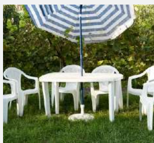
Outdoor and Patio Furniture