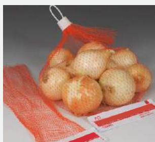
Produce packing bags and films