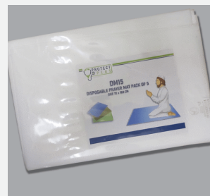
Single use prayer mats and barriers