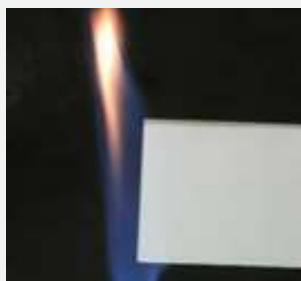
Technical and performance masterbatches