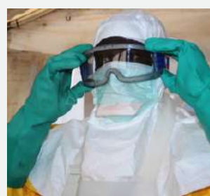
Hospital supplies and consumables