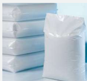
Heavy duty industrial packaging and protection