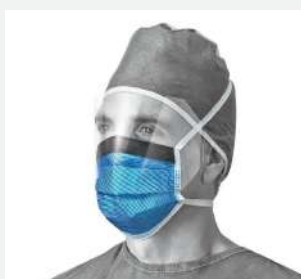
Surgical face masks

Some of the materials that fall into this category are: