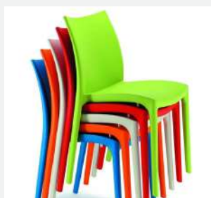
Stackable Plastic Chairs

Some of the products in this sub-sector are: