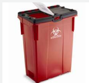
Medical waste containers and bags