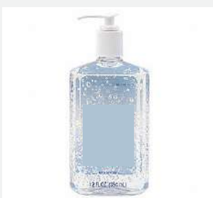
Hand sanitizer bottles and pumps