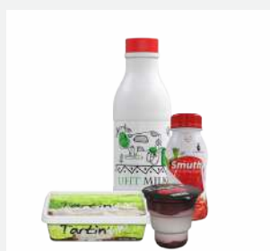
Meat, milk and yogurt packaging products