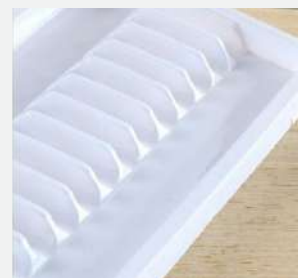
Pharmaceutical blister packaging