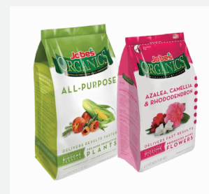
Fertilizers and pesticide packaging