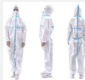
Protective body garments