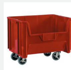
Large stackable containers