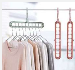
Cloth storage and handling products