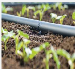
Drip irrigation pipes and systems