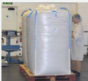
Pharmaceutical bulk bags

Some of the products in this sub-sector include: