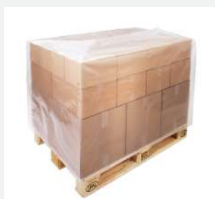
Pallet protection stretch films and pallet covering