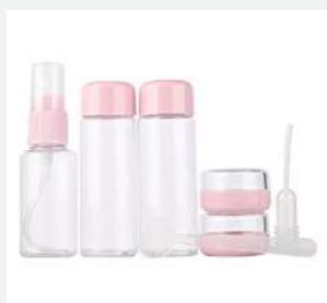
Cosmetics, detergents bottles