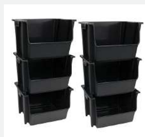
Plastic shelving, cupboards and storage containers