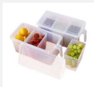
Food organization and storage containers