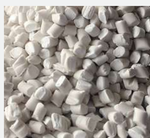
Plastic/calcium carbonate compounds

Some of the products currently being produced by this sub-sector include: