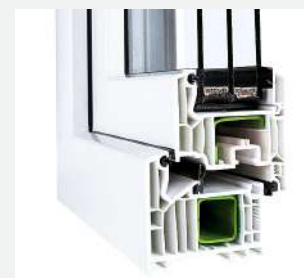
High energy and sound insulation window and door systems