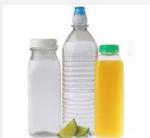
Dairy, juice, soft drink, water bottles